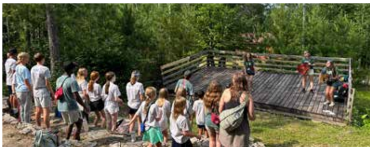
Enjoying some group singing at Camp Vermilion in July