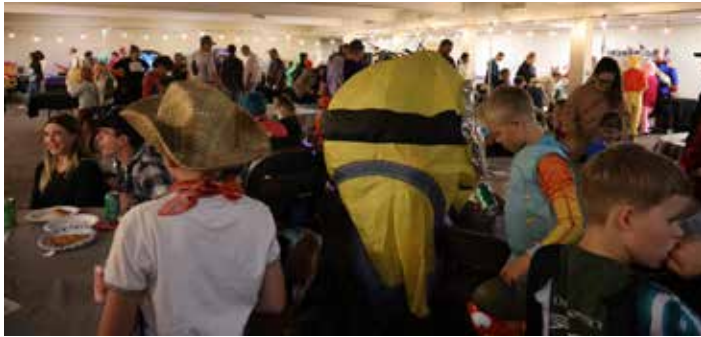
So many looking for tricks and treats at October's indoor Trunk or Treat, due to inclement weather