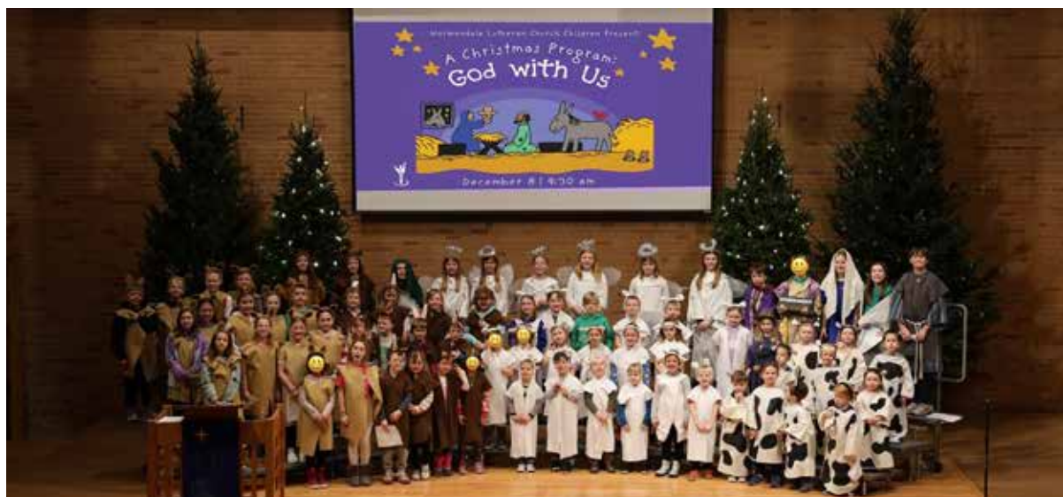
The cast of "God With Us," our 2024 Christmas program in early December