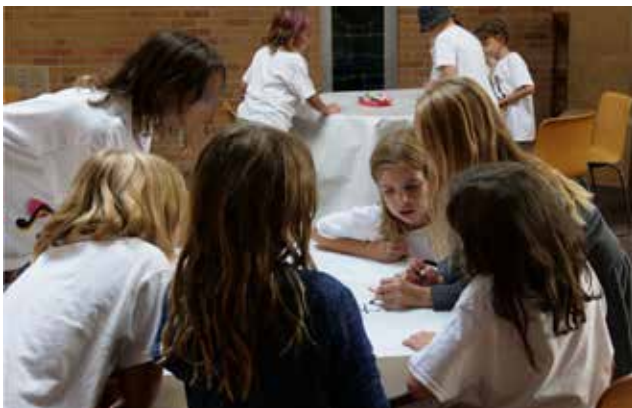
Working together during Choir Camp