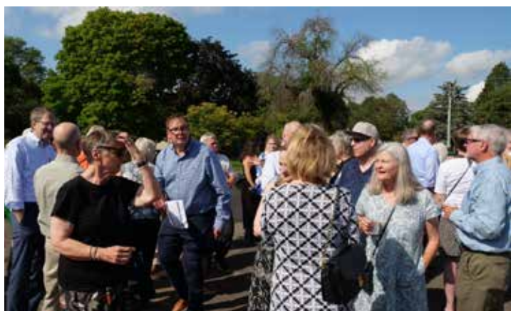
Arranging our 2024 Age Circle at September's Rally Fest