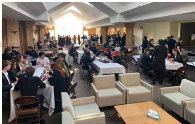
Stetson University School of Music Concert Choir ready for their performance here in May.