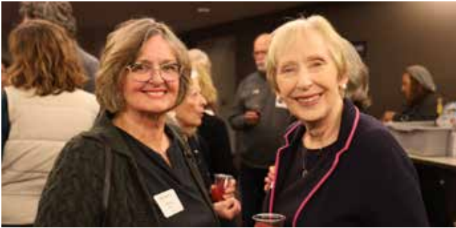
Socializing before our Financial Pledge Dinners