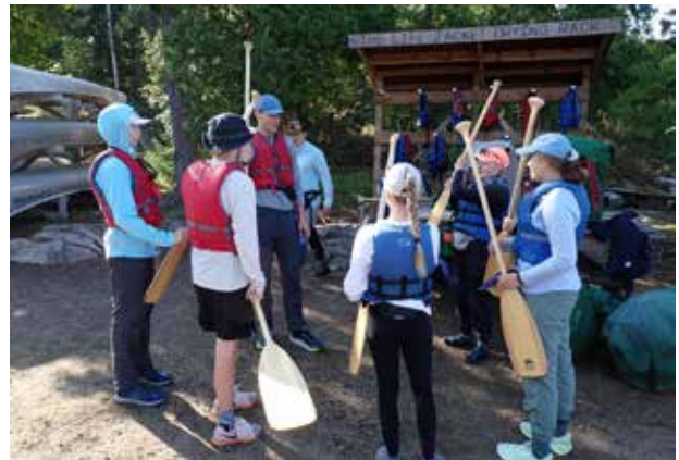
Paddle check before traversing the Boundary Waters