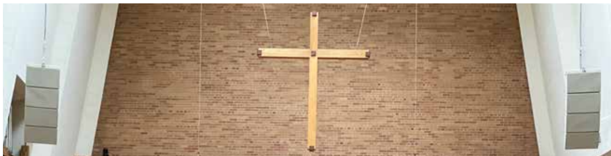
Newly installed speakers along with complete audio overhaul in sanctuary from December

The Center is blessed to be financially healthy. We were a recipient of $60,000 in annual support from Normandale Lutheran Church, and $7,525 in direct gifts from members this year. The remaining revenue was successfully raised from gifts, contracts, grants, and other sources. We are deeply honored to have represented Normandale Lutheran Church among seniors and caregivers for over a quarter-of-a-century, and we look ahead in 2025 to celebrate together the shared impact of our ministry, and that of the church within the community.