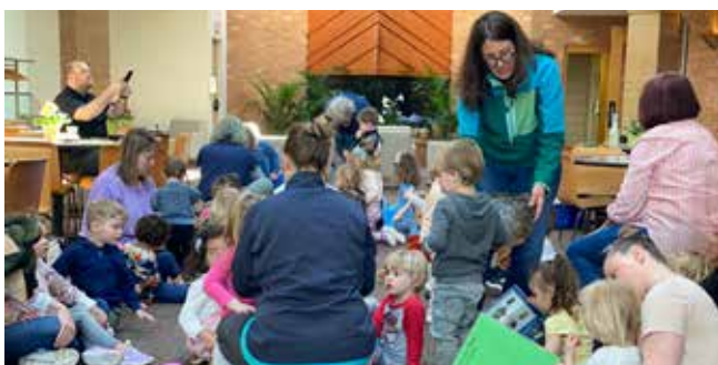
Learning about animals at April's intergenerational Second Wednesday event

Looking ahead, registration for the 2025-2026 school year is now open, and we are eager to welcome new families into our classrooms. We will continue to build on the strong foundation we have established and look forward to the opportunity to serve even more children and families in the year ahead.