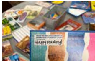
Constructing a free library now outside the main entrance during June's Summer Stretch