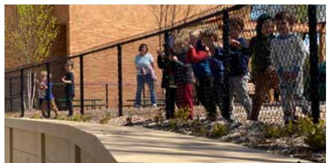
Supervisors watching landscapers work in Trinity Commons