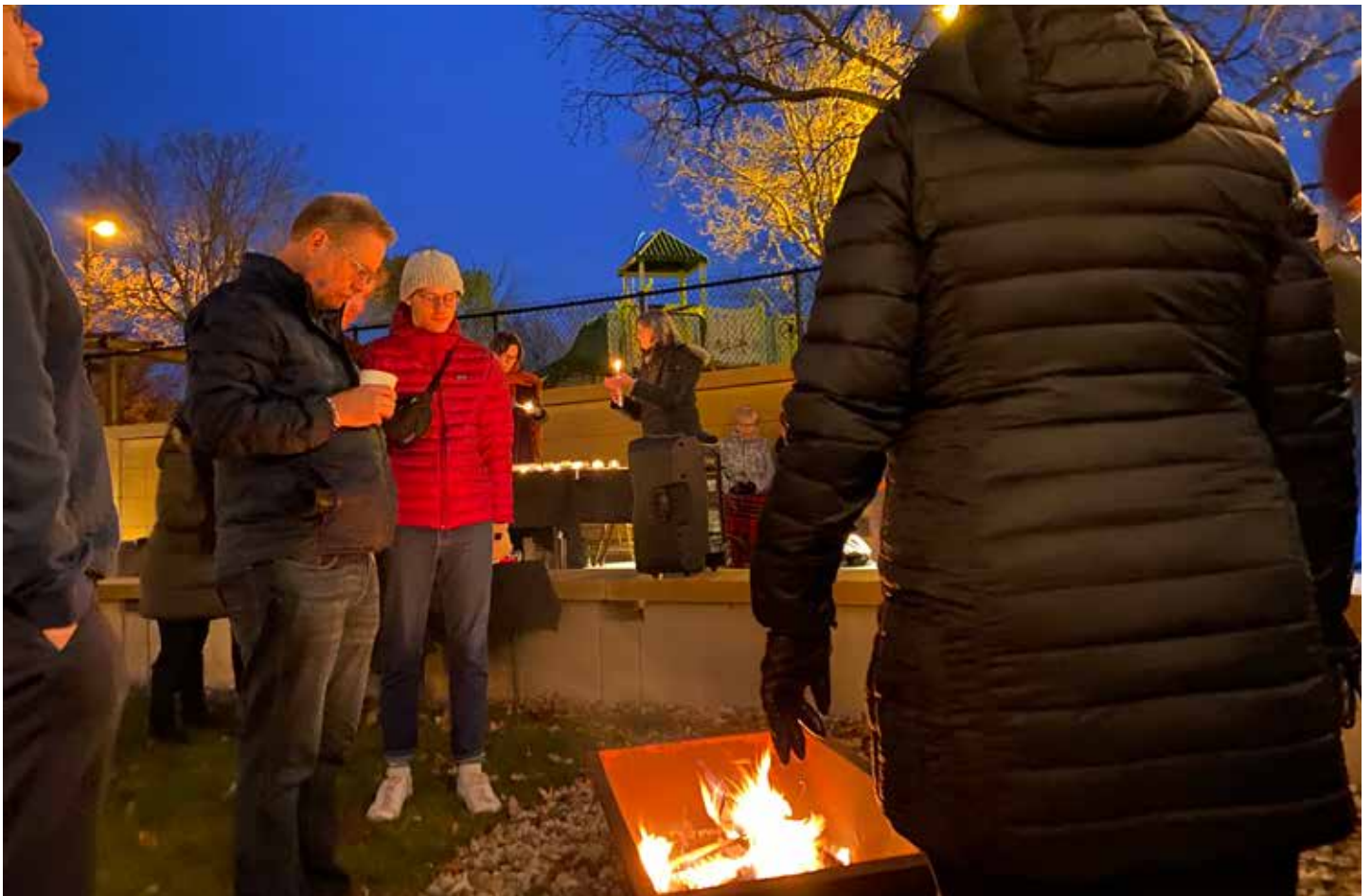
Remembering the saints who have gone before us at our All-Saints Day service out in Trinity Commons