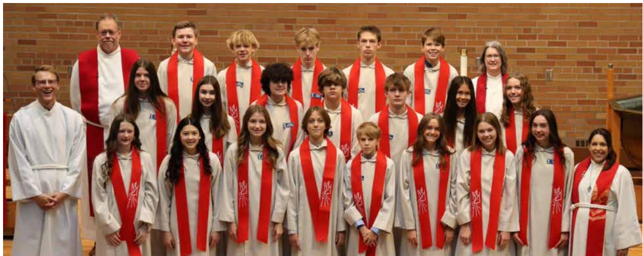
Our 2024 confirmation class was recognized on Reformation Sunday in October