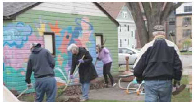
Helping clean up around Normandale House