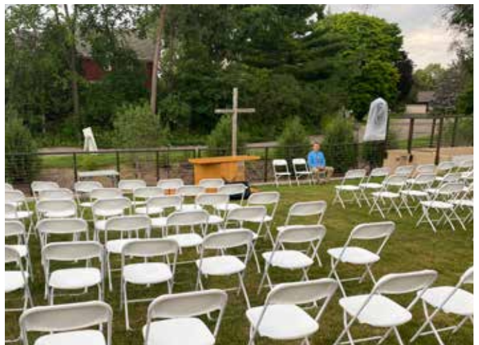
Ready for outside worship... right as it starts to rain...

We hope you are pleased with the columbarium and look forward to its ongoing use in the future as a beloved place to regularly recall and honor those that have come before us at Normandale Lutheran Church!