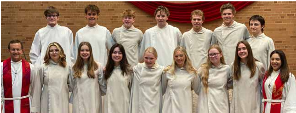
Recognizing our high school graduates at worship in May

A heartfelt thanks for your ongoing support — we take our commitment to our members and the church very seriously.