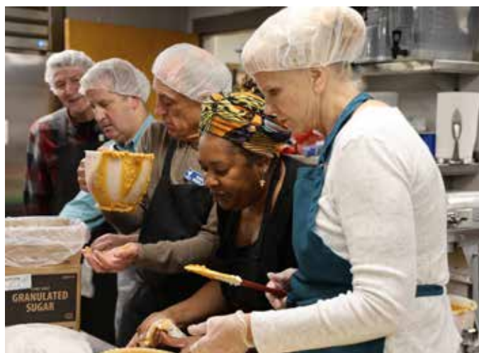
Baking Sweet Potato Comfort Pies in November

Our Racial Justice and Equity Team (RJET) hosted and helped sponsor some extraordinary events this past year, including but not limited to celebrating the tenth anniversary with our friends at Tapestry Lutheran in Richfield and participating in a book group with them. We also baked and shared delicious Sweet Potato Comfort Pies with our partners near Thanksgiving, which gave us the opportunity to connect and learn from our neighbors around topics like belonging and race.