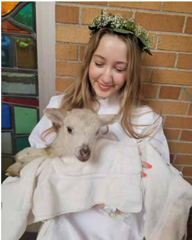
Our annual Easter Sunday special guest