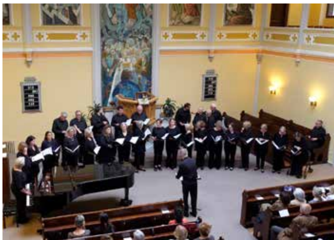
Choir and friends preparing to sing in Germany