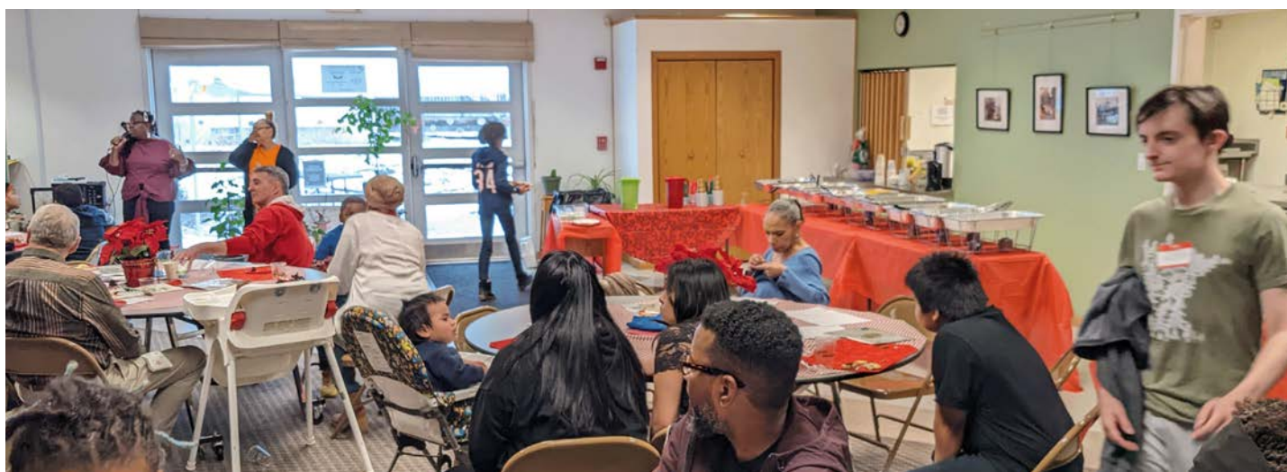
Families celebrated at the annual Normandale House Christmas Party with delicious soul food, professional family photos, and various games. Residents also received beautiful quilts that were donated from the church community as well as significant gift cards to purchase gifts!