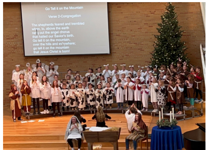
Normandale's "Friendly Beasts" singing during our Christmas program in December 2022